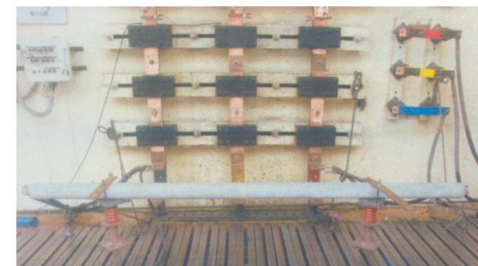
Earthing electrode encased in Marconite tested at CPRI Bangalore for peak fault current upto 80kA for 1.11 seconds

Its distinctive properties result from a unique manufacturing process, utilising specific raw material feedstocks, carefully selected and mixed in tightly controlled ratios before undergoing a range of manufacturing processes and thermal treatments.