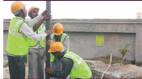
Marconite for deeper installation