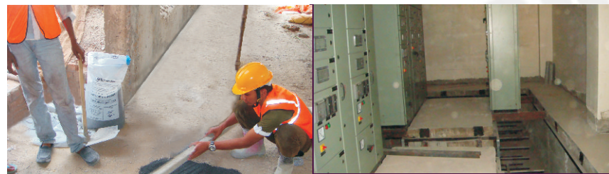
Anti-static flooring in Marconite at RRVPNL 220kVA GIS Sub-station in Jaipur (Rajasthan).

Marconite® is supplied throughout the world via a network of distributors and agents.